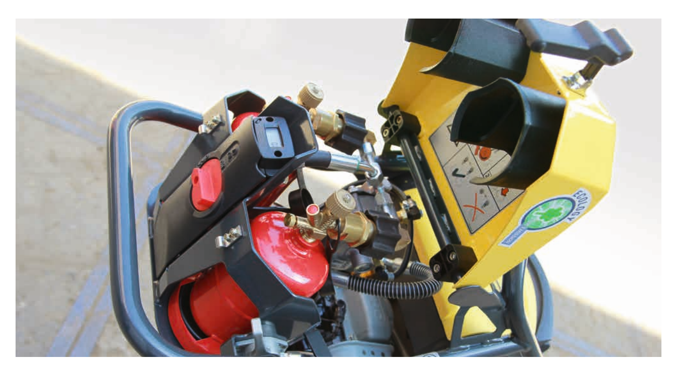
Technical modification may be required in certain markets.