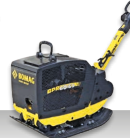
BPR 60/65 Operating weight: 400 kg Centrifugal force: 60 kN Working width: 650 mm

Hand-guided Double Drum Vibratory Rollers