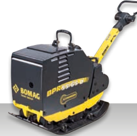
BPR 55/65 D Operating weight: 455 kg Centrifugal force: 55 kN Working width: 650 mm