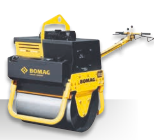
BW 71 E-2 Operating weight: 488 kg Centrifugal force: 16 kN Working width: 710 mm

BW 55 E Operating weight: 150 kg Centrifugal force: 10 kN Working width: 560 mm