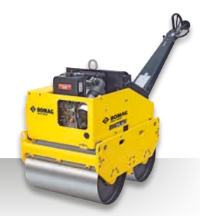
BW 75 H Operating weight: 1,040 kg Centrifugal force: 40 kN Working width: 750 mm not available in US + CN + IN