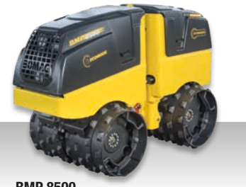
BMP 8500 Operating weight: 1,595 kg Centrifugal force: 72/36 kN Working width: 610 mm / 850 mm