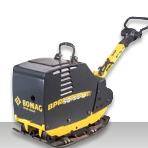
BPR 50/55 D Operating weight: 405 kg Centrifugal force: 50 kN Working width: 550 mm

BPR 45/55 D Operating weight: 400 kg Centrifugal force: 45 kN Working width: 550 mm