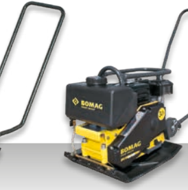
BVP 12/50 A Operating weight: 72 kg Centrifugal force: 10 kN Working width: 360 mm Centrifugal force: 10 kN Working width: 300 mm

BVP 18/45 Operating weight: 91 kg Centrifugal force: 18 kN Working width: 450 mm