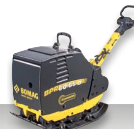
BPR 60/65 D Operating weight: 460 kg Centrifugal force: 60 kN Working width: 650 mm

Hand-guided Double Drum Vibratory Rollers