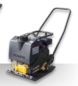
BPS 18/45 Operating weight: 91 kg Centrifugal force: 18 kN Working width: 450 mm available in CN

BVP 18/45 D Operating weight: 109 kg Centrifugal force: 18 kN Working width: 450 mm