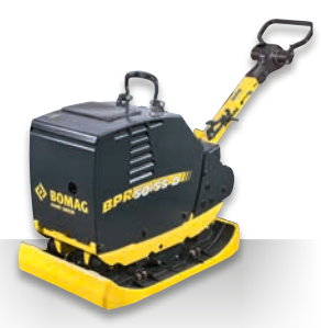
STONEGUARD Working width: from 530 to 680 mm available for BPR 25/50 D, BPR35/60 BPR 35/60 D, BPR 50/55 D BPR 55/65 D, BPR 60/65 D